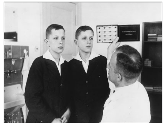
Figure 1. Conducting Twin Studies at the Institute for Anthropology, Human Heredity, and Eugenics in Berlin, February 1928.

Some physicians and biologists who supported eugenics had to accommodate themselves to Nazism’s rabid anti-Semitism. But in return for accepting the persecution of Jews as a source of biologic degeneration, many in the medical community welcomed the new emphasis on biology and heredity, increased research funding, and new career opportunities — including openings created