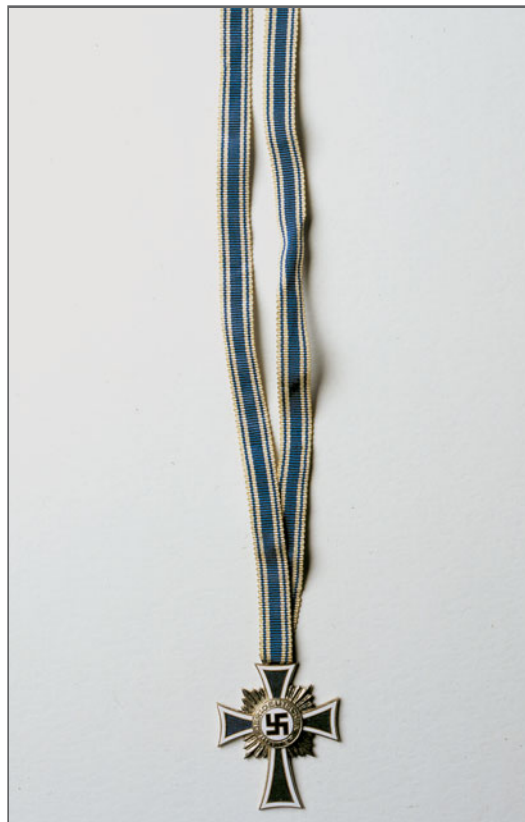
Figure 3. Bronze Honor Cross of German Motherhood.

In 1946 and 1947, the American military tribunal at Nuremberg tried 20 German physicians and 3 lay accomplices for medical experiments using prisoners of Nazi concentration camps. But most